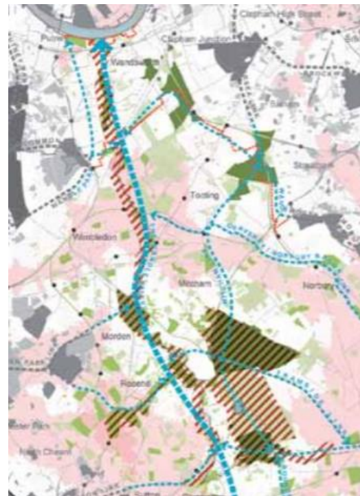
Boundary of Wandle Valley Regional Park in All London Green Grid

7. Policy O8.7 can be further strengthened by: